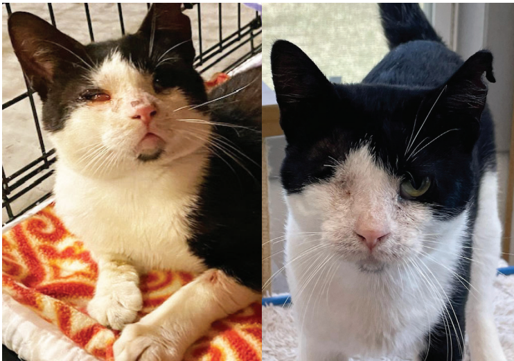
Spunky (Before & After)

If you see a cat in your future come meet Spunky. You will fall in love.